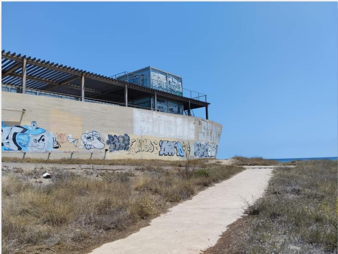
PHOTO 3 and 4. The dockworkers' school building