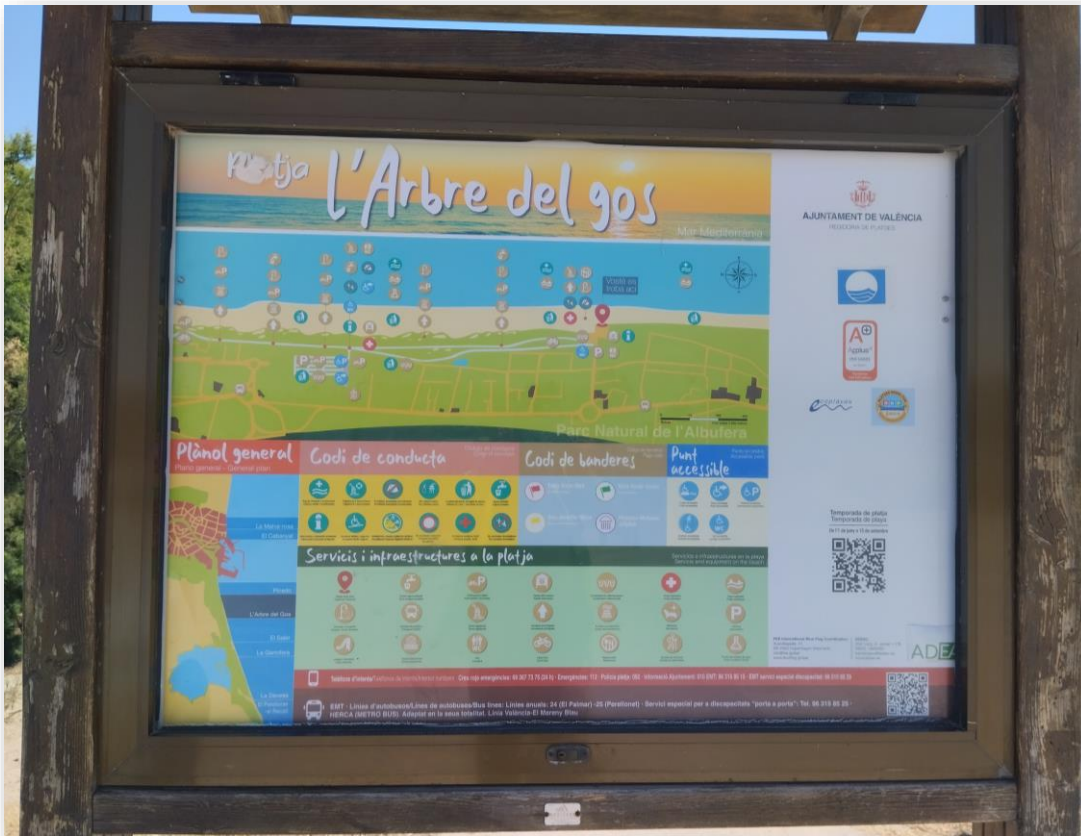
PHOTO 5. Signage at L'Arbre del Gos Beach