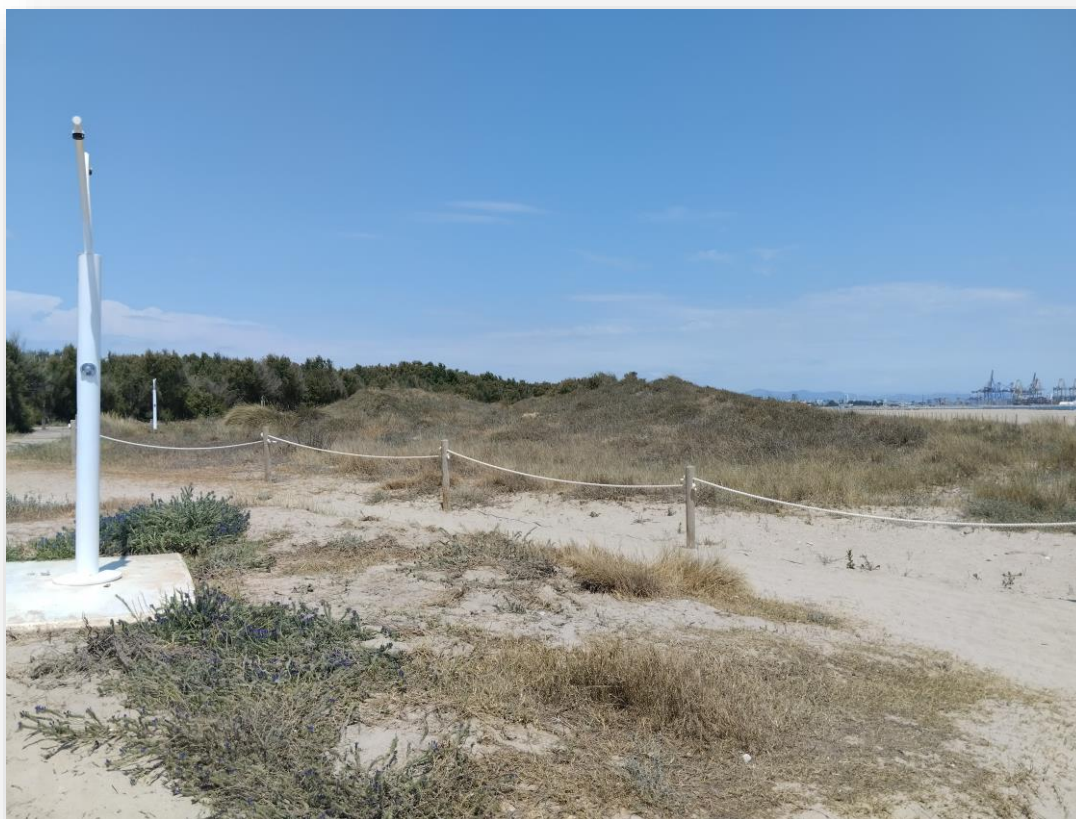
PHOTO 1 and 2. Landscape of L'Arbre del Gos Beach.