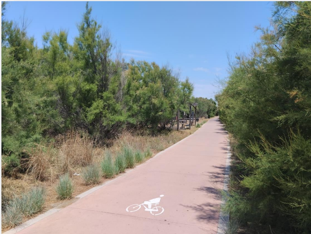
PHOTO 6. Cycling path that connects Pinedo with El Saler along L'Arbre del Gos Beach.