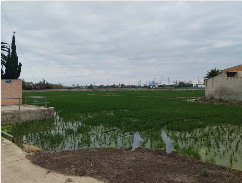
PHOTO 2. Rice field today in the El Tremolar neighborhood