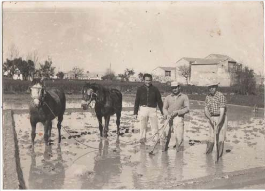
PHOTO 1. Group of farmers in a rice cultivation marsh around 1960.