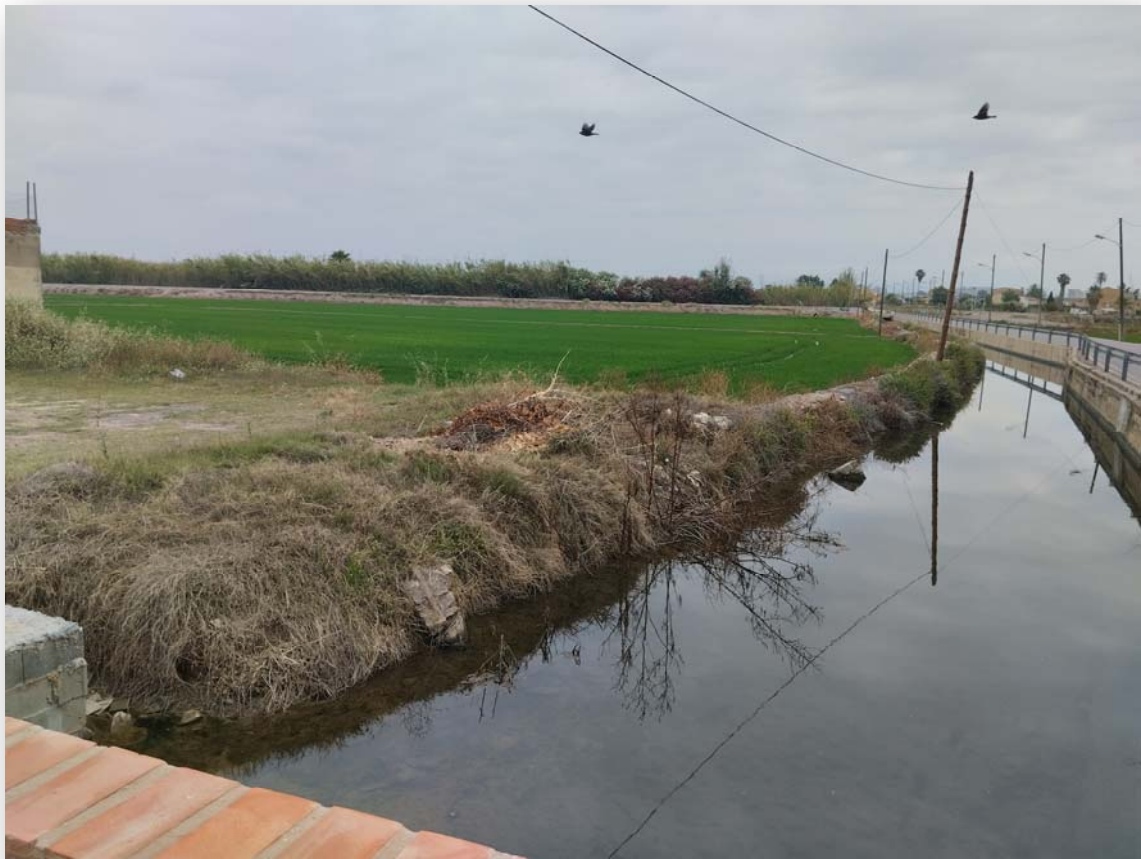
PHOTO 3 and 4. Irrigation canals in the El Tremolar neighborhood