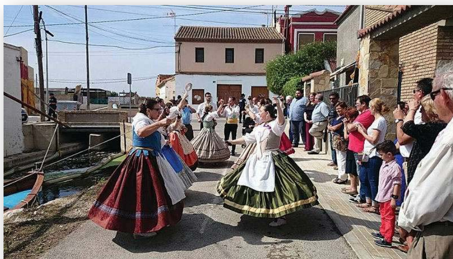
PHOTO 5, 6 and 7. The festivities of El Tremolar