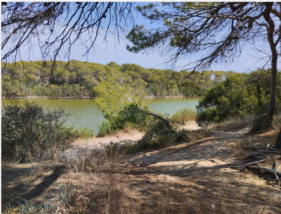
PHOTO 6. View of the surroundings