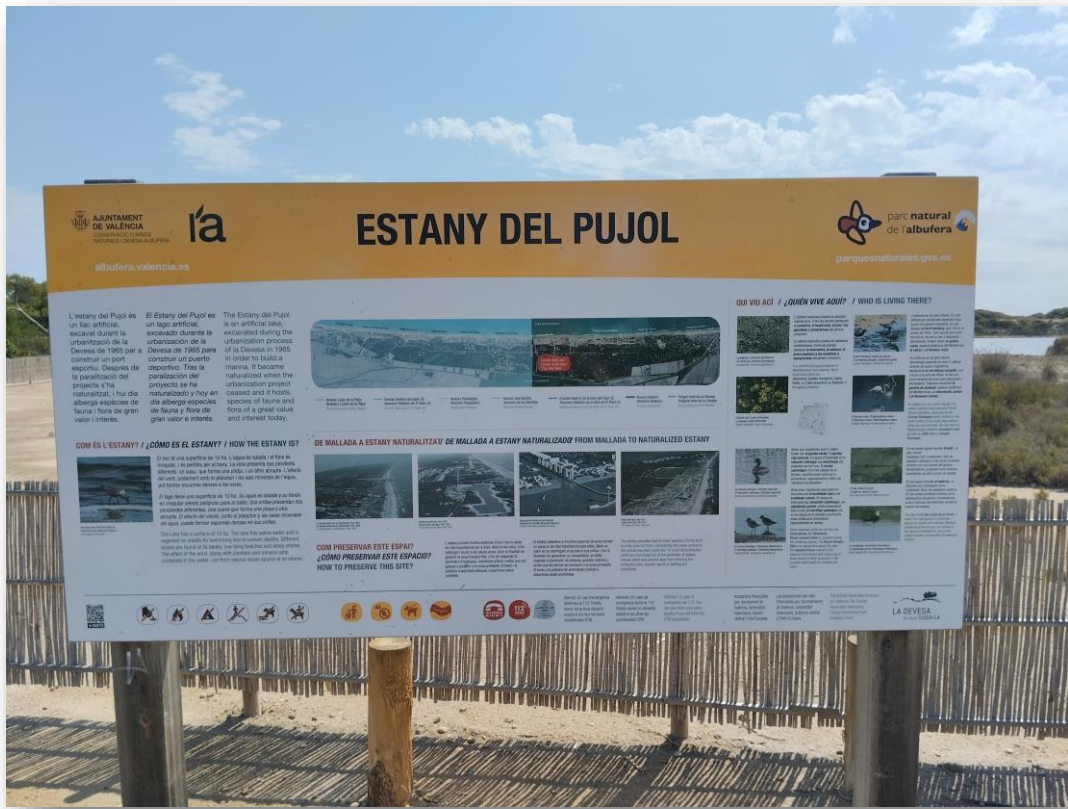
PHOTO 5. Informational signage of the Albufera Natural Park.