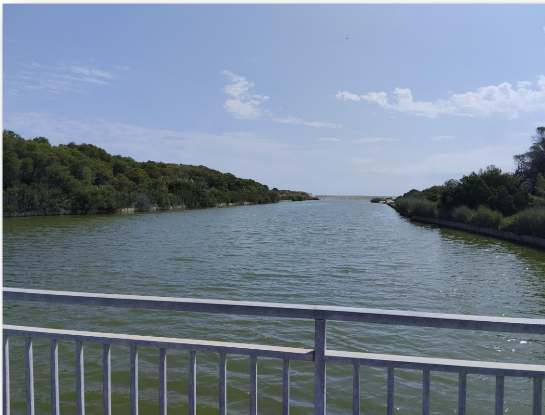
PHOTO 3 and 4. The Pujol canal