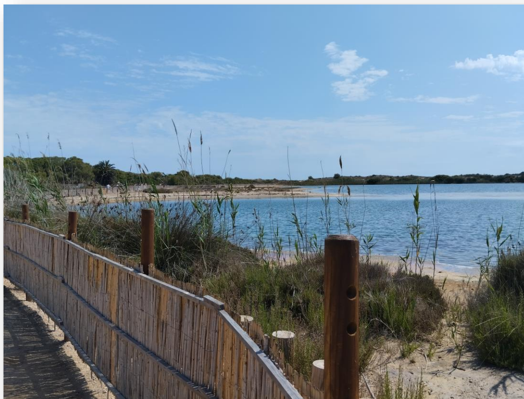
PHOTO 1 and 2. The Pujol lake or estany.