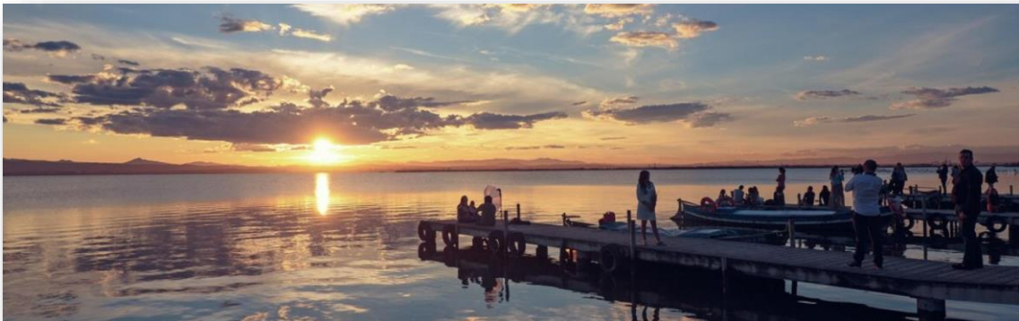
PHOTO 7 and 8. Pier and viewpoint of the Pujol canal. Sunset views (photo 8: Visit Valencia)